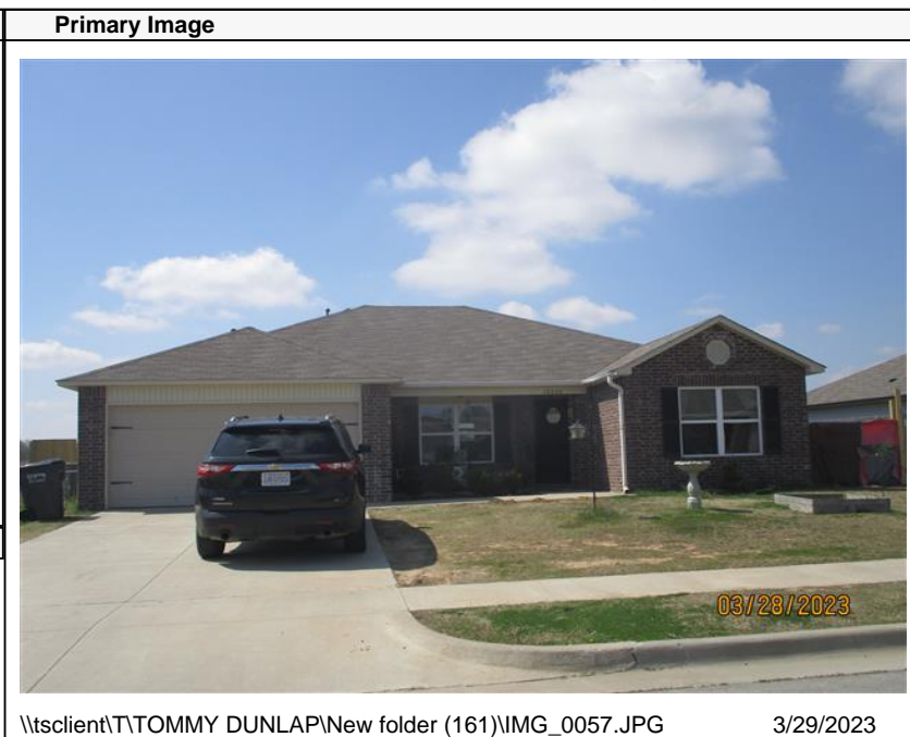
\\tsclient\T\TOMMY DUNLAP\New folder (161)\IMG_0057.JPG 3/29/2023