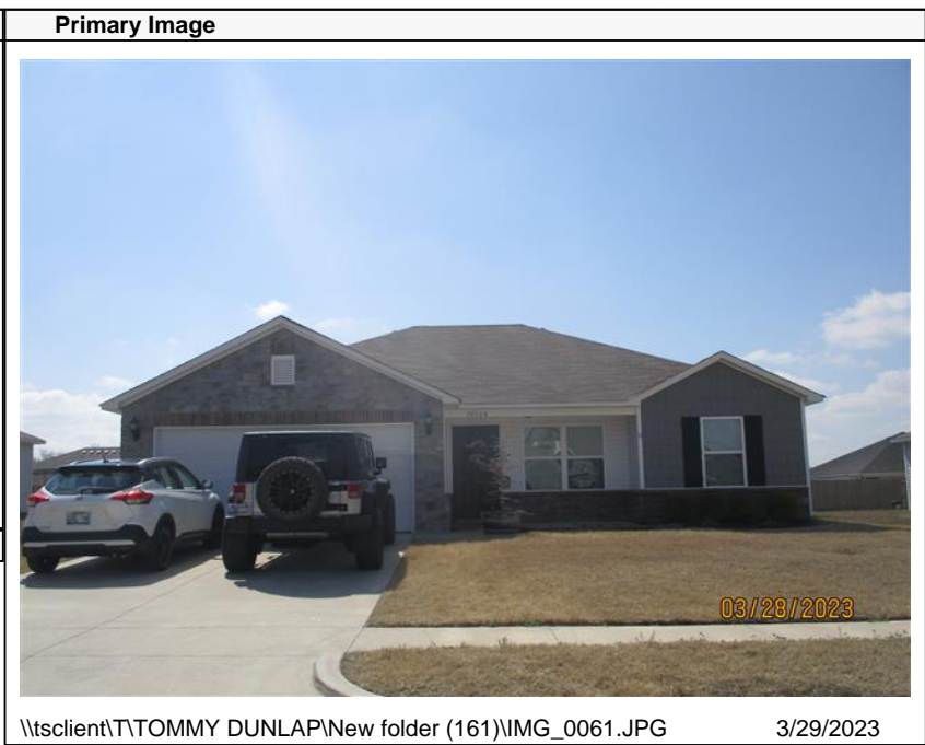
\\tsclient\T\TOMMY DUNLAP\New folder (161)\IMG_0061.JPG 3/29/2023