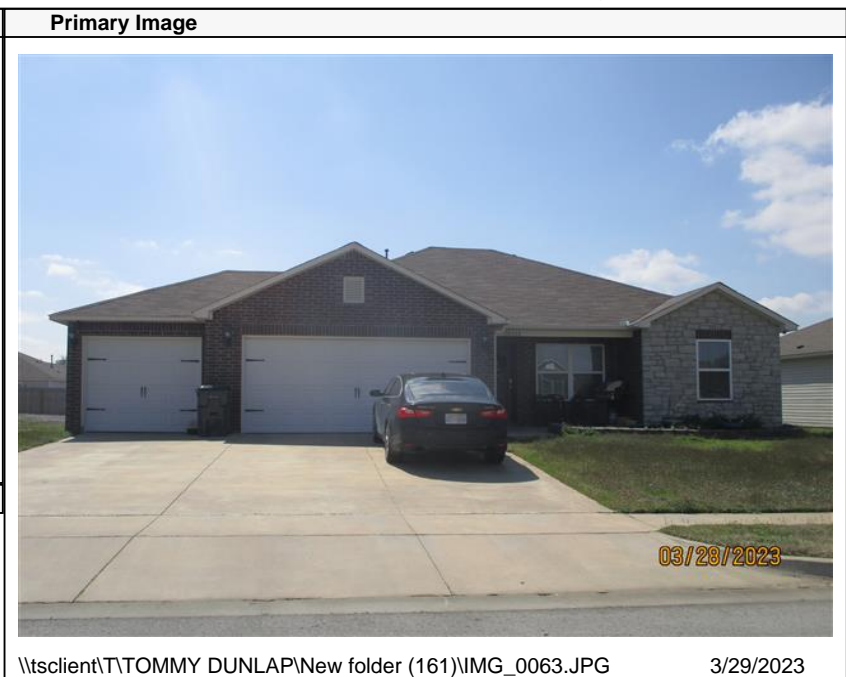
\\tsclient\T\TOMMY DUNLAP\New folder (161)\IMG_0063.JPG 3/29/2023