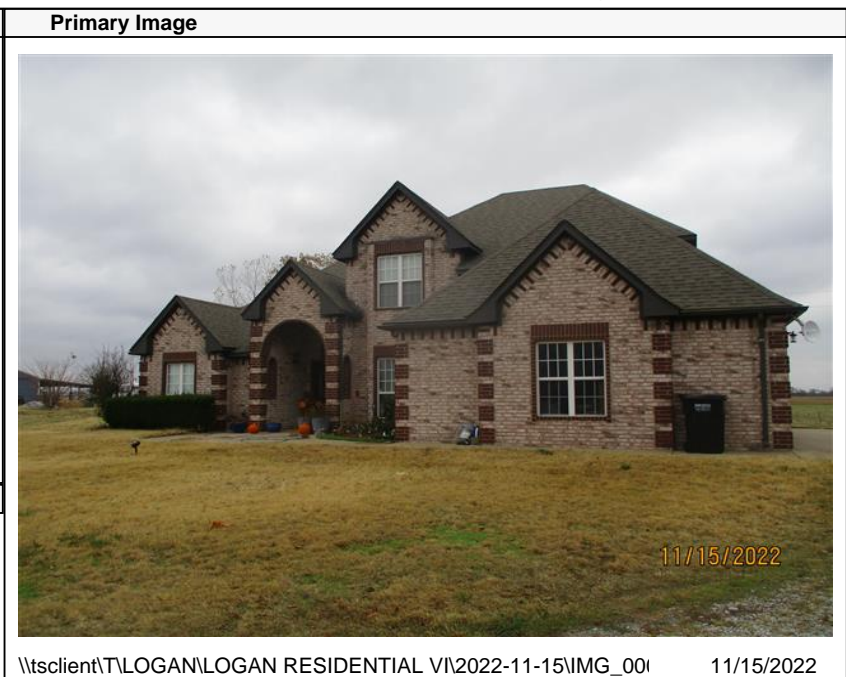
\\tsclient\T\LOGAN\LOGAN RESIDENTIAL VI\2022-11-15\IMG_001 11/15/2022