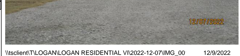
\\tsclient\T\LOGAN\LOGAN RESIDENTIAL VI\2022-12-07\IMG_00 12/9/2022