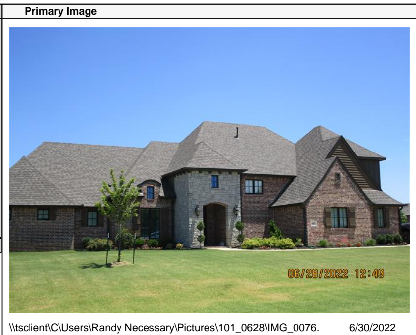
\\tsclient\C\Users\Randy Necessary\Pictures\101_0628\IMG_0076. 6/30/2022