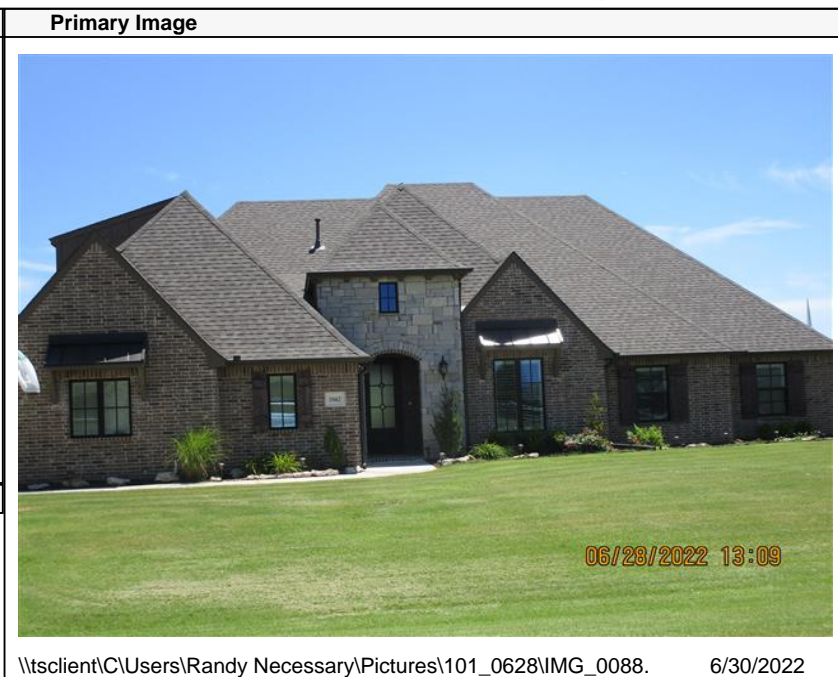
\\tsclient\C\Users\Randy Necessary\Pictures\101_0628\IMG_0088. 6/30/2022