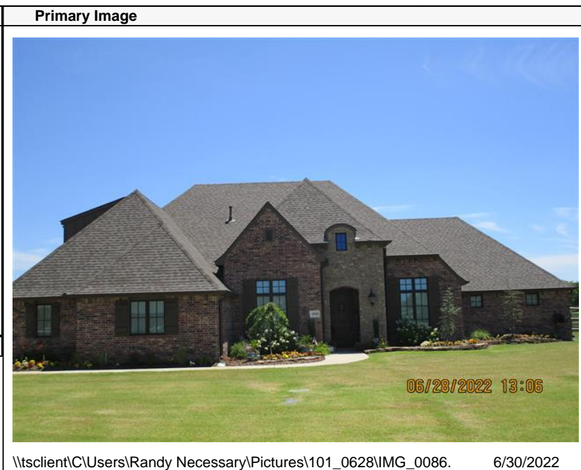
\\tsclient\C\Users\Randy Necessary\Pictures\101_0628\IMG_0086. 6/30/2022