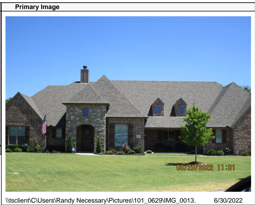
\\tsclient\C\Users\Randy Necessary\Pictures\101_0629\IMG_0013. 6/30/2022