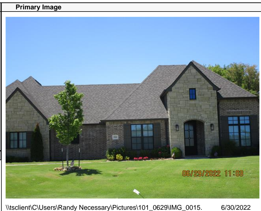
\\tsclient\C\Users\Randy Necessary\Pictures\101_0629\IMG_0015. 6/30/2022