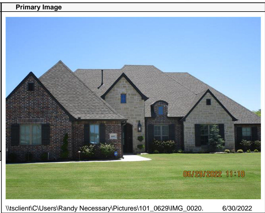
\\tsclient\C\Users\Randy Necessary\Pictures\101_0629\IMG_0020. 6/30/2022