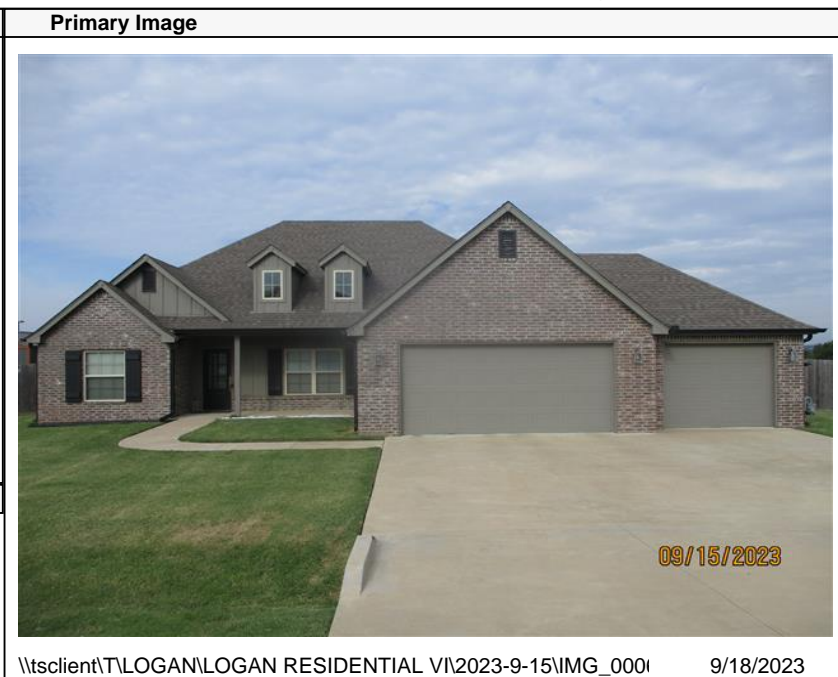
\\tsclient\T\LOGAN\LOGAN RESIDENTIAL VI\2023-9-15\IMG_0001 9/18/2023