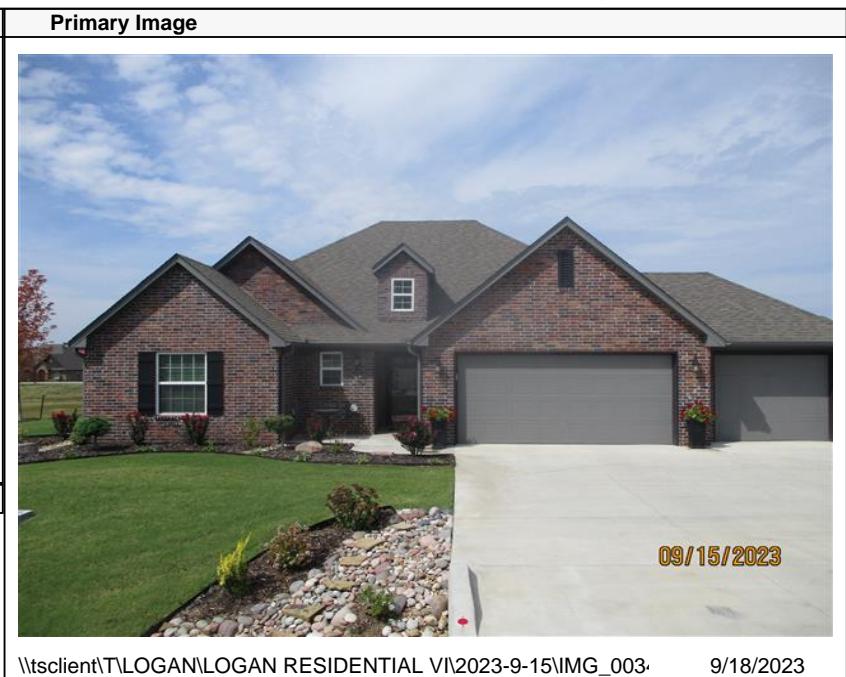
\\tsclient\T\LOGAN\LOGAN RESIDENTIAL VI\2023-9-15\IMG_003 9/18/2023