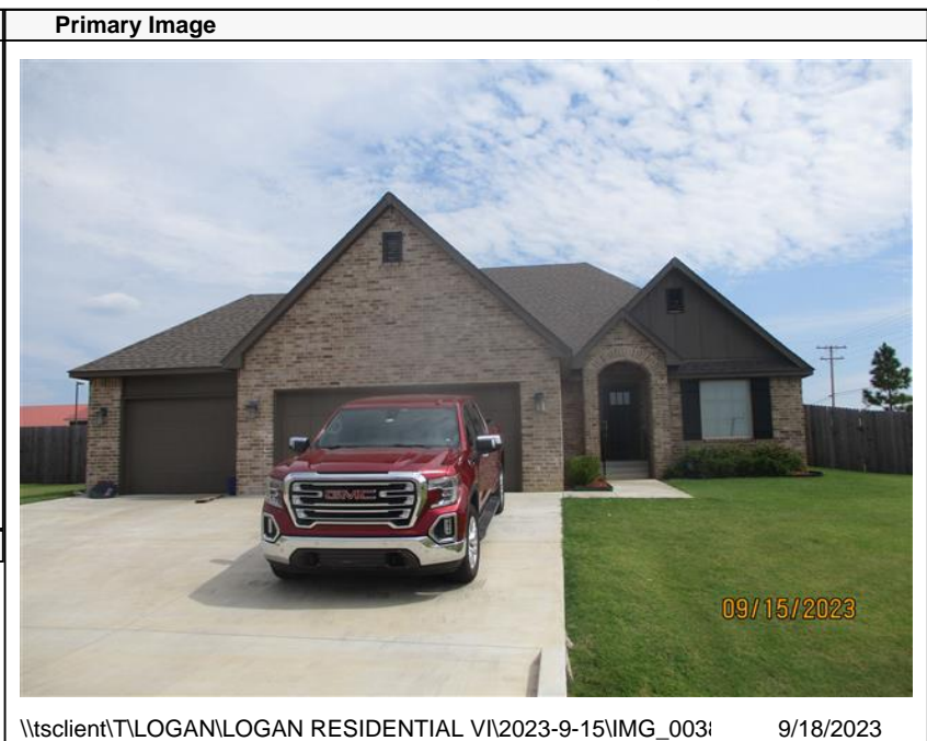
\\tsclient\T\LOGAN\LOGAN RESIDENTIAL VI\2023-9-15\IMG_003 9/18/2023