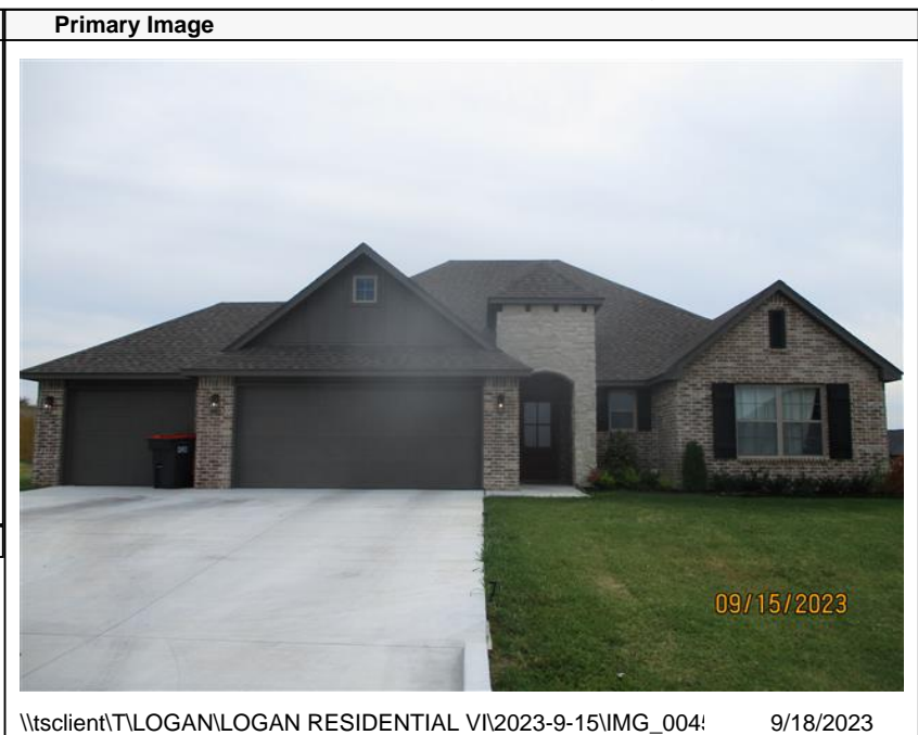
\\tsclient\T\LOGAN\LOGAN RESIDENTIAL VI\2023-9-15\IMG_004! 9/18/2023