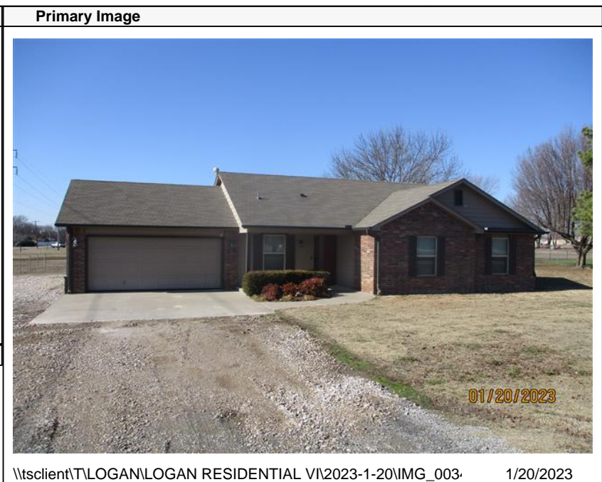
\\tsclient\T\LOGAN\LOGAN RESIDENTIAL VI\2023-1-20\IMG_003 1/20/2023