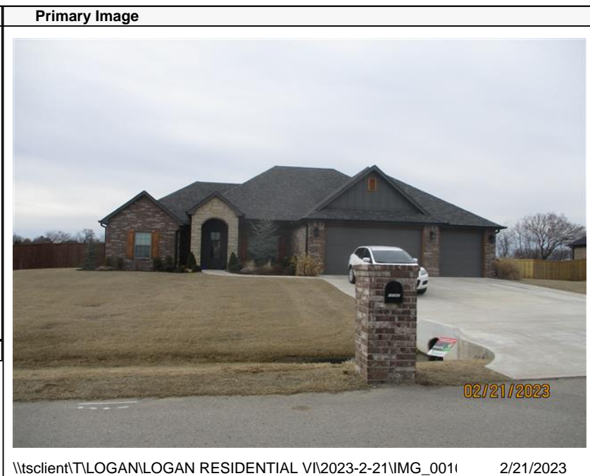
\\tsclient\T\LOGAN\LOGAN RESIDENTIAL VI\2023-2-21\IMG_001 2/21/2023