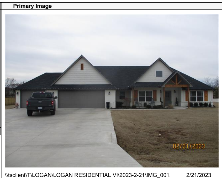
\\tsclient\T\LOGAN\LOGAN RESIDENTIAL VI\2023-2-21\IMG_001; 2/21/2023