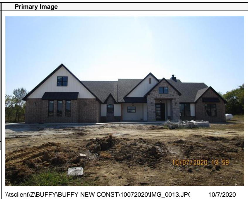
\\tsclient\Z\BUFFY\BUFFY NEW CONST\10072020\IMG_0013.JPG 10/7/2020