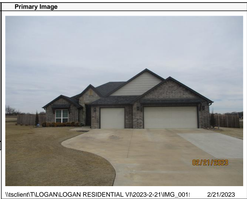
\\tsclient\T\LOGAN\LOGAN RESIDENTIAL VI\2023-2-21\IMG_001! 2/21/2023