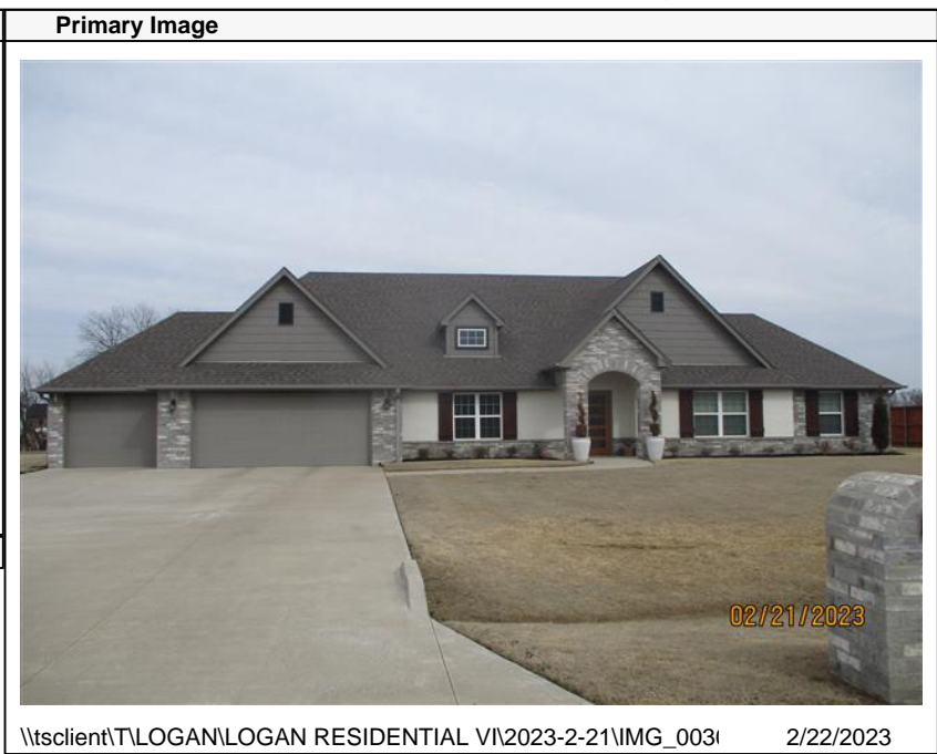
\\tsclient\T\LOGAN\LOGAN RESIDENTIAL VI\2023-2-21\IMG_003I 2/22/2023