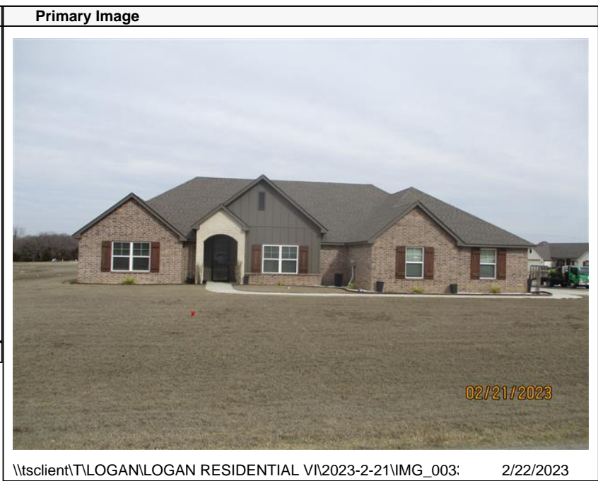
\\tsclient\T\LOGAN\LOGAN RESIDENTIAL VI\2023-2-21\IMG_003: 2/22/2023