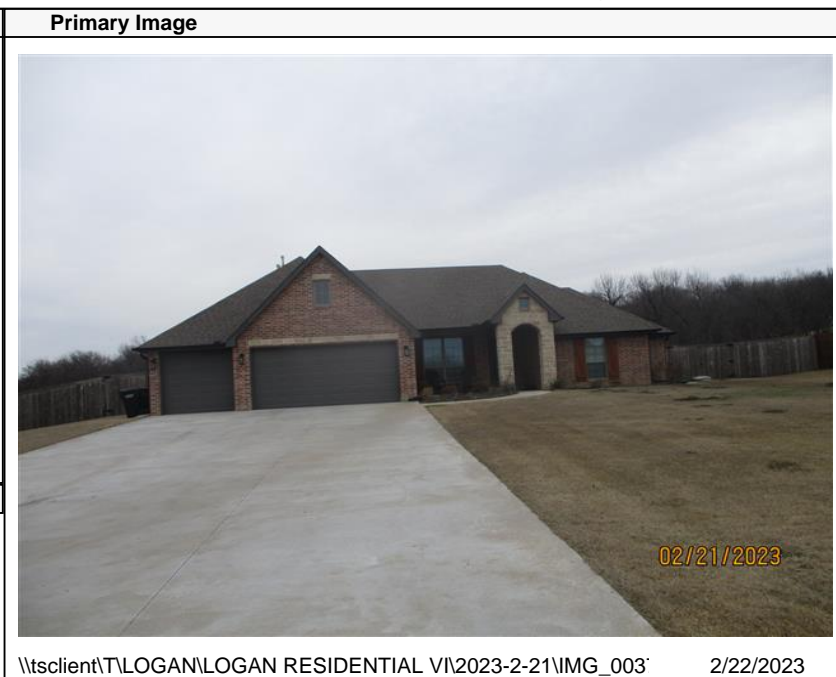
\\tsclient\T\LOGAN\LOGAN RESIDENTIAL VI\2023-2-21\IMG_003' 2/22/2023