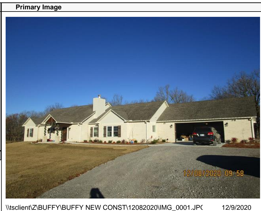
\\tsclient\Z\BUFFY\BUFFY NEW CONST\12082020\IMG_0001.JPG 12/9/2020