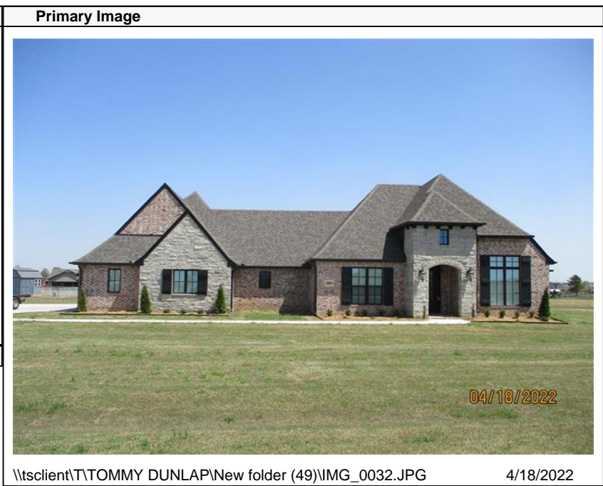
\\tsclient\T\TOMMY DUNLAP\New folder (49)\IMG_0032.JPG 4/18/2022