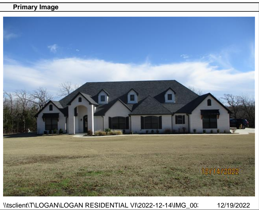
\\tsclient\T\LOGAN\LOGAN RESIDENTIAL VI\2022-12-14\IMG_00: 12/19/2022