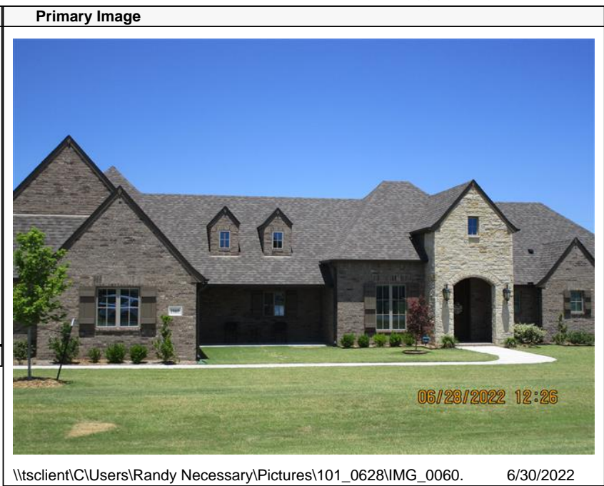
\\tsclient\C\Users\Randy Necessary\Pictures\101_0628\IMG_0060. 6/30/2022