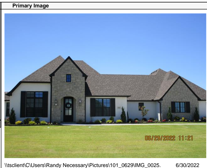
\\tsclient\C\Users\Randy Necessary\Pictures\101_0629\IMG_0025. 6/30/2022