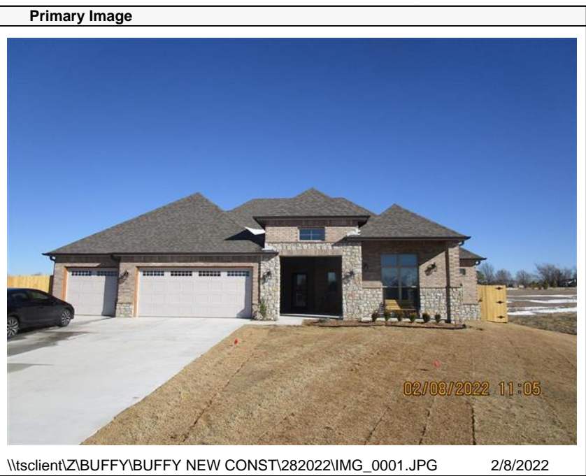
\\tsclient\Z\BUFFY\BUFFY NEW CONST\282022\IMG_0001.JPG 2/8/2022