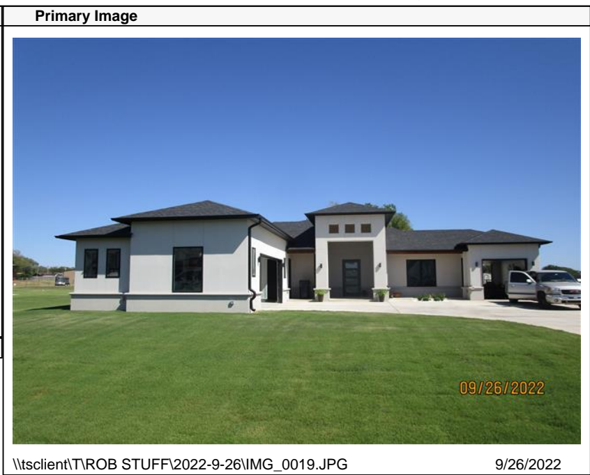
\\tsclient\T\ROB STUFF\2022-9-26\IMG_0019.JPG 9/26/2022