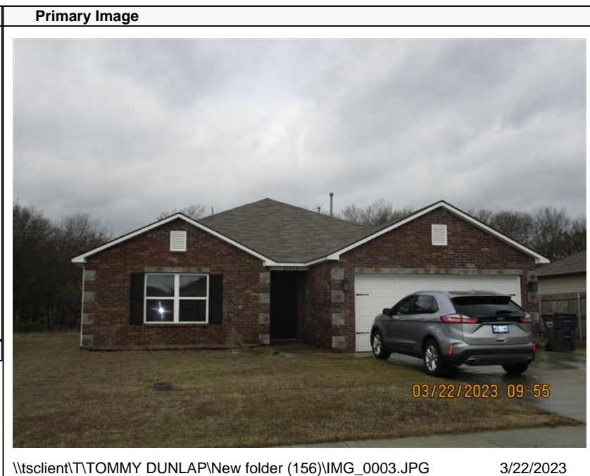
\\tsclient\T\TOMMY DUNLAP\New folder (156)\IMG_0003.JPG 3/22/2023