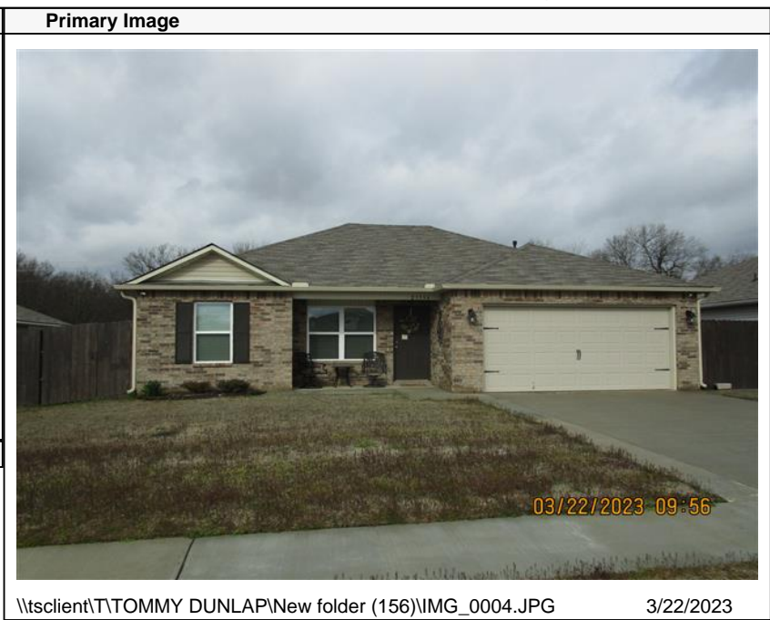
\\tsclient\T\TOMMY DUNLAP\New folder (156)\IMG_0004.JPG 3/22/2023