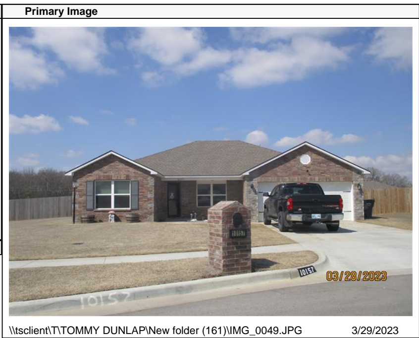
\\tsclient\T\TOMMY DUNLAP\New folder (161)\IMG_0049.JPG 3/29/2023