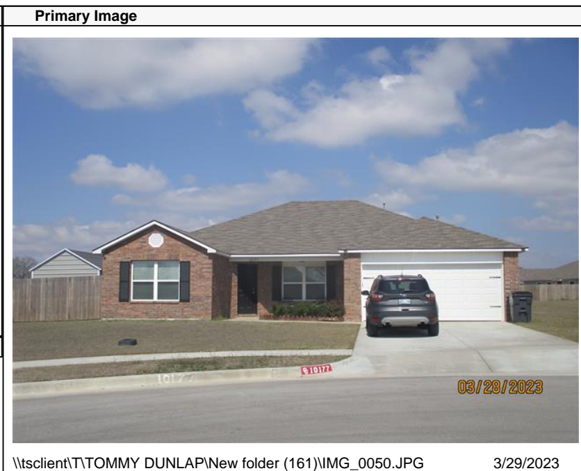
\\tsclient\T\TOMMY DUNLAP\New folder (161)\IMG_0050.JPG 3/29/2023