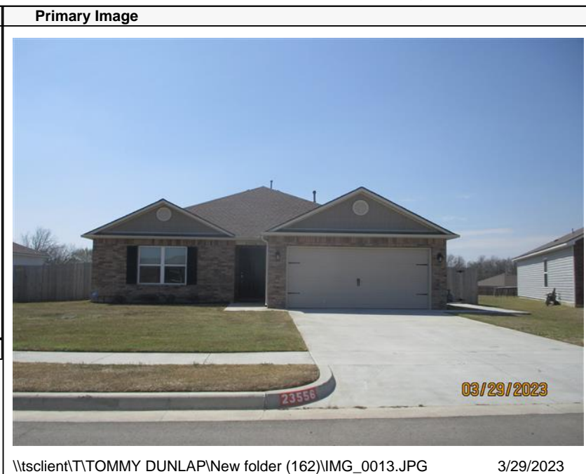
\\tsclient\T\TOMMY DUNLAP\New folder (162)\IMG_0013.JPG 3/29/2023