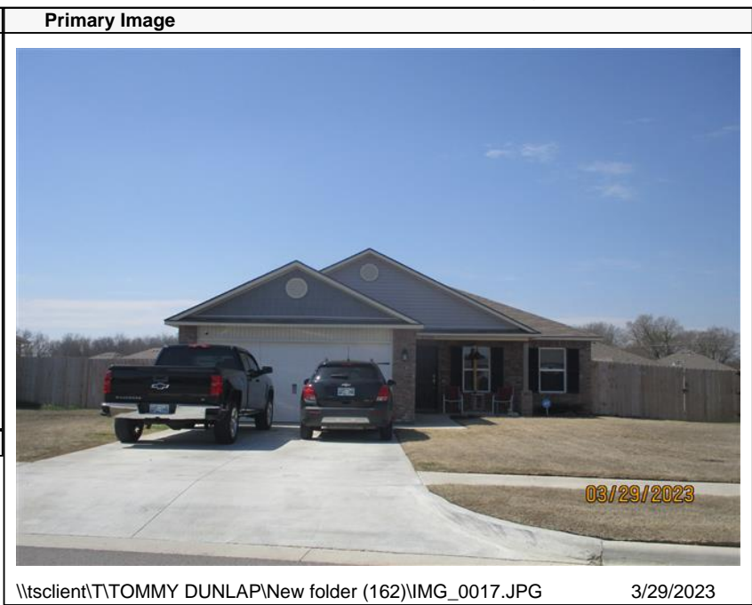
\\tsclient\T\TOMMY DUNLAP\New folder (162)\IMG_0017.JPG 3/29/2023