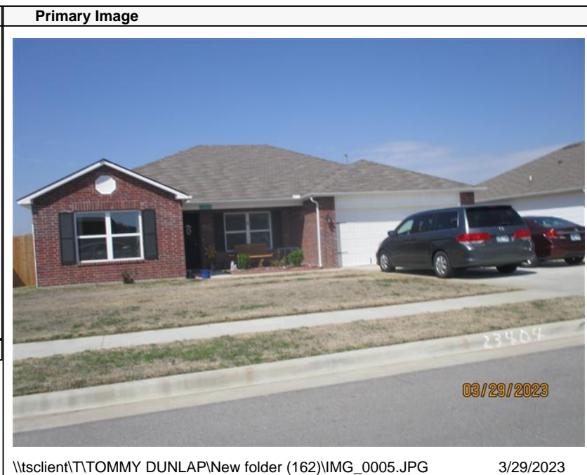
\\tsclient\T\TOMMY DUNLAP\New folder (162)\IMG_0005.JPG 3/29/2023