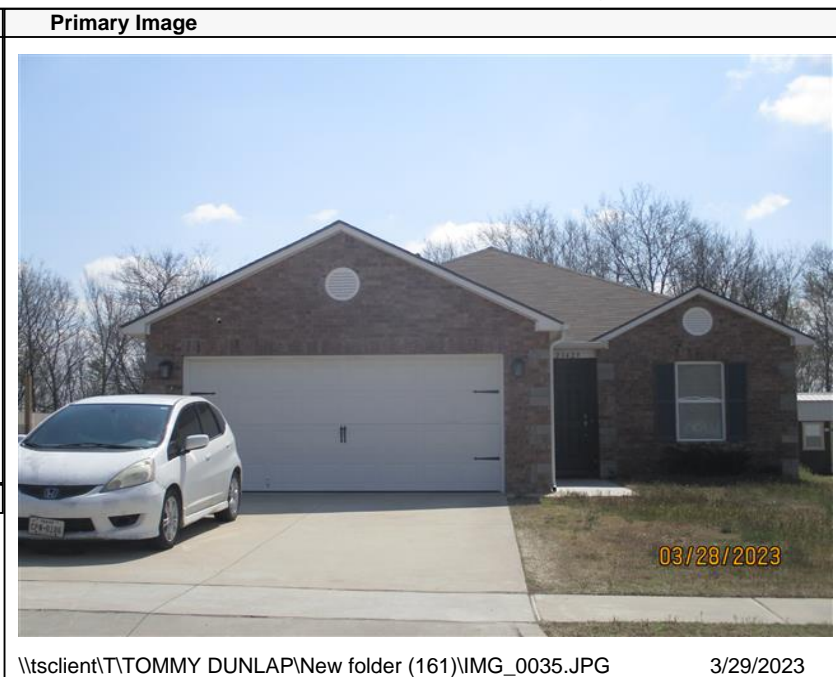
\\tsclient\T\TOMMY DUNLAP\New folder (161)\IMG_0035.JPG 3/29/2023