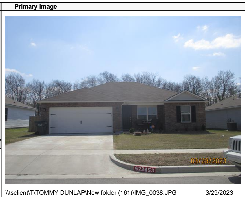
\\tsclient\T\TOMMY DUNLAP\New folder (161)\IMG_0038.JPG 3/29/2023