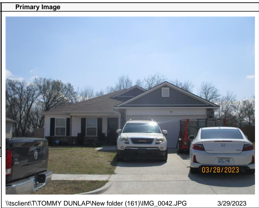
\\tsclient\T\TOMMY DUNLAP\New folder (161)\IMG_0042.JPG 3/29/2023