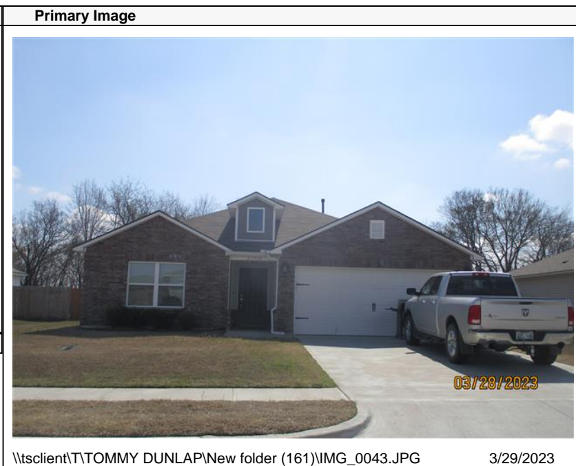
\\tsclient\T\TOMMY DUNLAP\New folder (161)\IMG_0043.JPG 3/29/2023