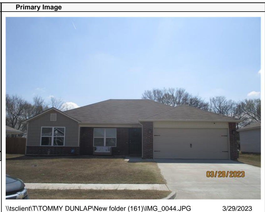
\\tsclient\T\TOMMY DUNLAP\New folder (161)\IMG_0044.JPG 3/29/2023