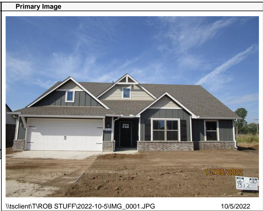
\\tsclient\T\ROB STUFF\2022-10-5\IMG_0001.JPG 10/5/2022