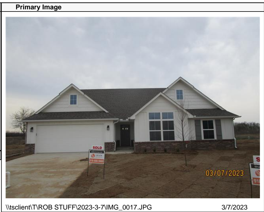
\\tsclient\T\ROB STUFF\2023-3-7\IMG_0017.JPG 3/7/2023