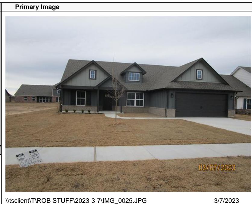
\\tsclient\T\ROB STUFF\2023-3-7\IMG_0025.JPG 3/7/2023