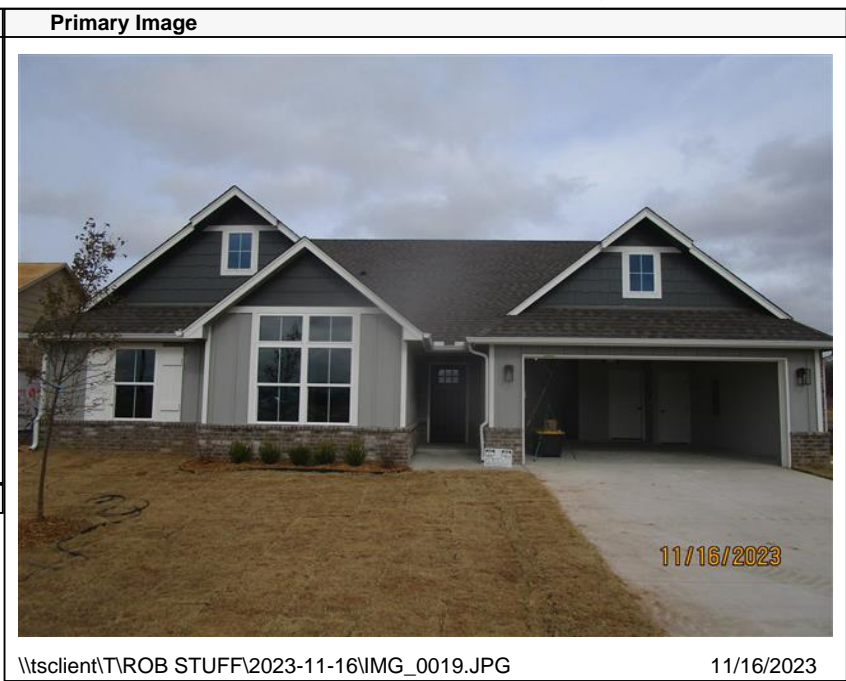
\\tsclient\T\ROB STUFF\2023-11-16\IMG_0019.JPG 11/16/2023