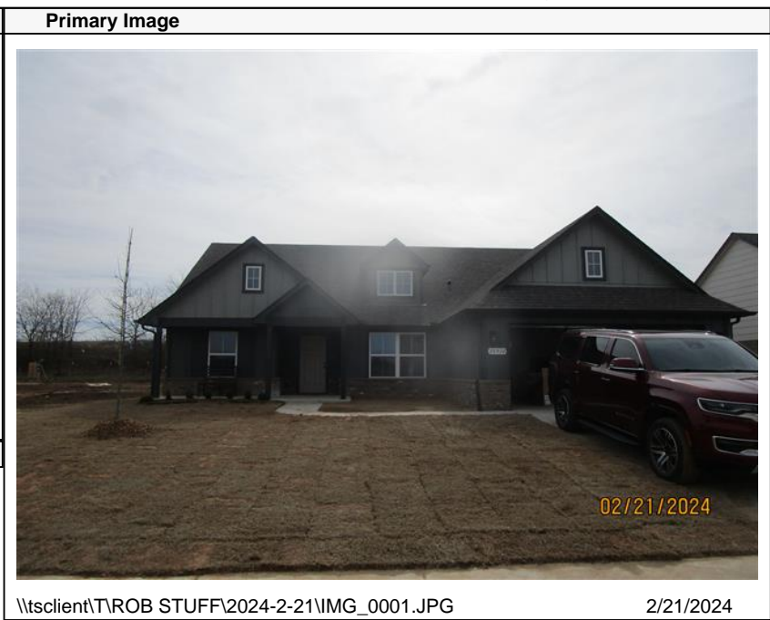
\\tsclient\T\ROB STUFF\2024-2-21\IMG_0001.JPG 2/21/2024