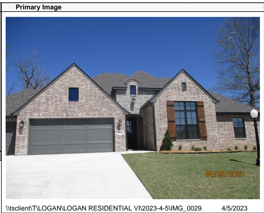
\\tsclient\T\LOGAN\LOGAN RESIDENTIAL VI\2023-4-5\IMG_0029. 4/5/2023