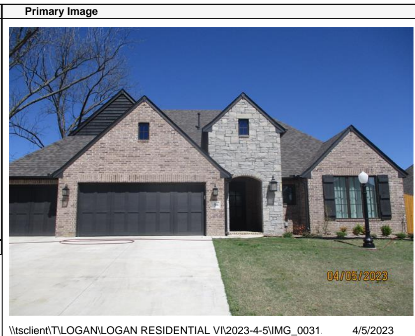
\\tsclient\T\LOGAN\LOGAN RESIDENTIAL VI\2023-4-5\IMG_0031. 4/5/2023