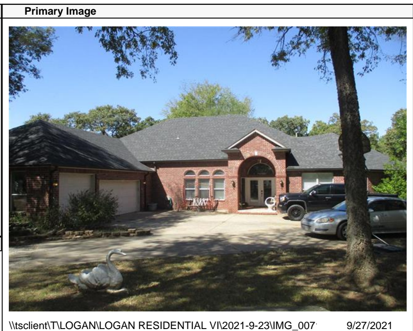
\\tsclient\T\LOGAN\LOGAN RESIDENTIAL VI\2021-9-23\IMG_007 9/27/2021